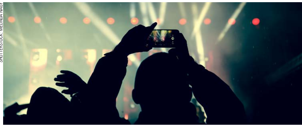
Jamaica's tourism sector is now the global benchmark for post-pandemic leisure travel activities.