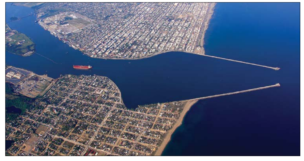
With access to both the Pacific and the Gulf, Mexico has a privileged position