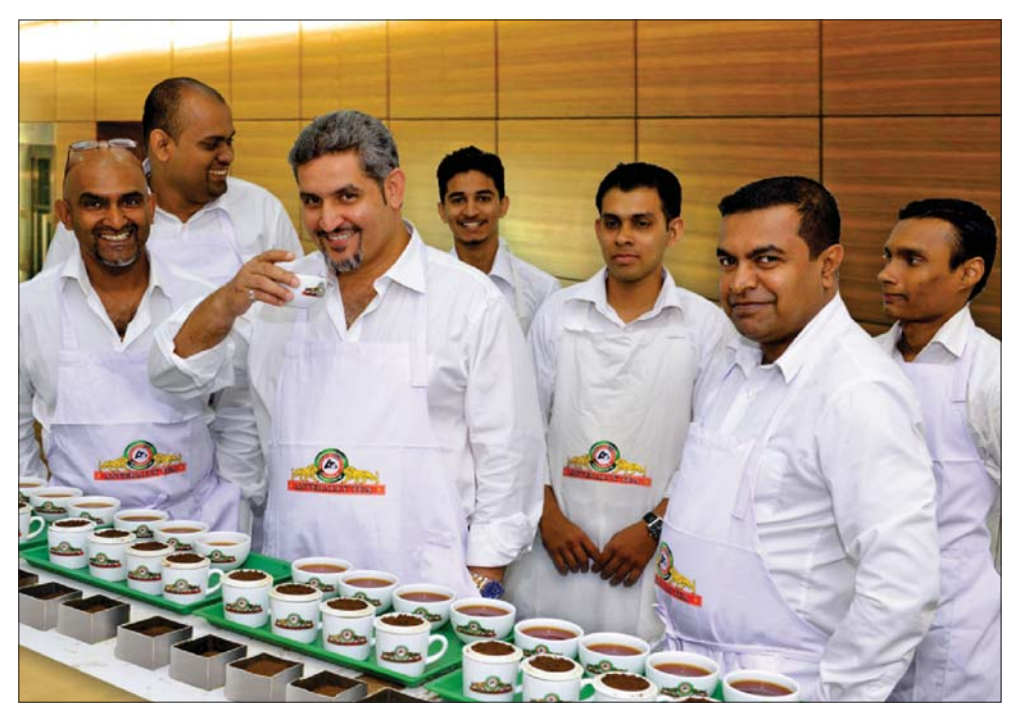
Anverally tea tasters