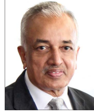
Malik Samarawickrama Minister of Development Strategies and International Trade