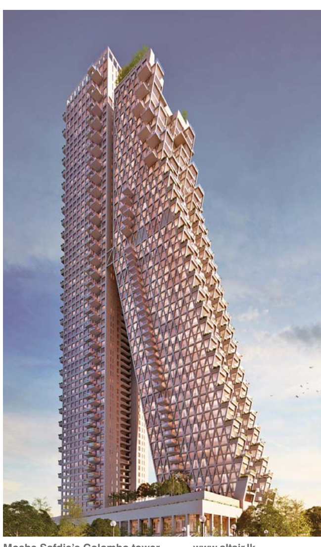
Moshe Safdie's Colombo tower.